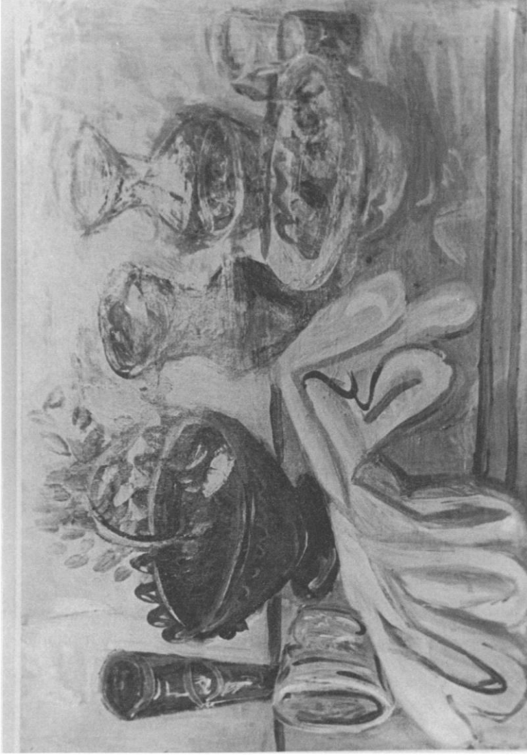
Figure 1. Pierre Tal Coat, Still Life , oil, 81 × 54 cm. Reproduced by permission of Holly Stevens and Watkinson Library, Trinity College.